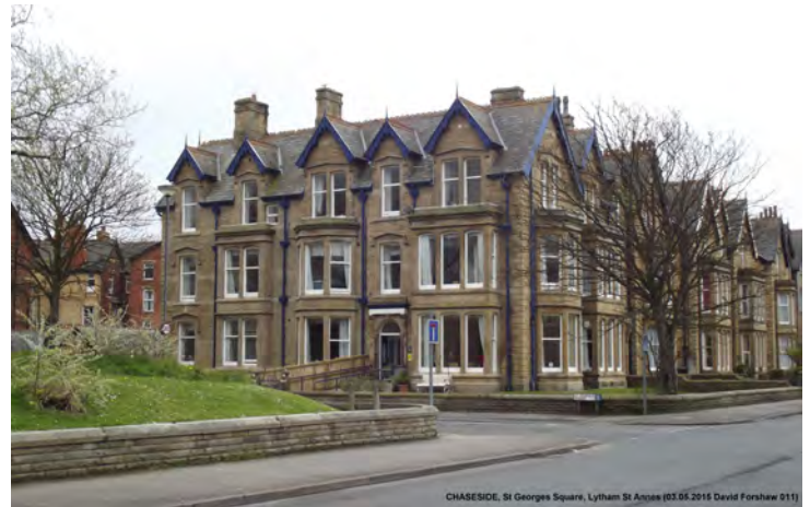
CHASESIDE, St Georges Square, Lytham St Annes (03.05.2016 011)

{Pictured Right: This is a modern shot of Chaseside which was one of the V.A.D.(Voluntary Aid Detachment) hospitals / convalescent homes for the military in Lytham & St Annes in WW1 along with the likes of Starr Hills, Pembroke House School and the Imperial Hydro.}