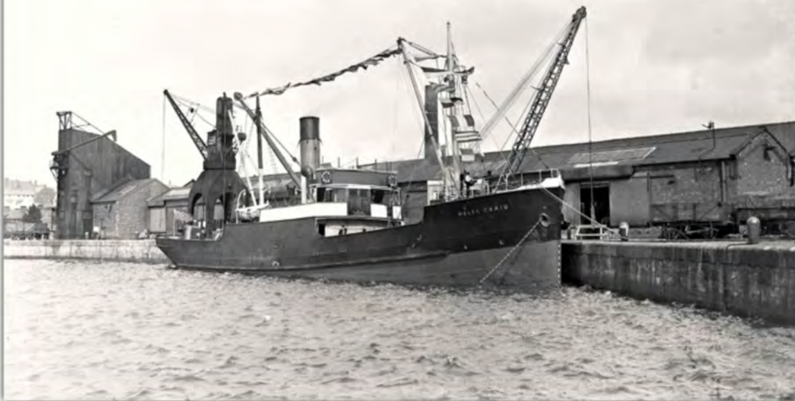
S.S. Helen Craig at Preston Dock in 1952, decorated to celebrate Preston Guild

the seas roll and pitch and break over the shallows, over those banks. Water 10 miles wide across the estuary, and 100 miles or more westwards to Ireland. No wonder this estuary was feared before man confined and tamed the deep water channel running straight like a road to the port, 12 miles from here.