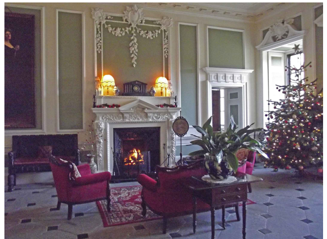
The Reception Room where members gathered before the 2018 Christmas Lunch