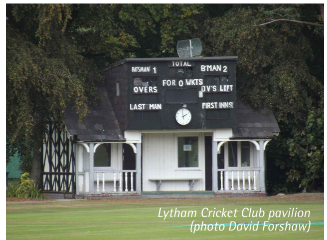
Lytham Cricket Club pavilion