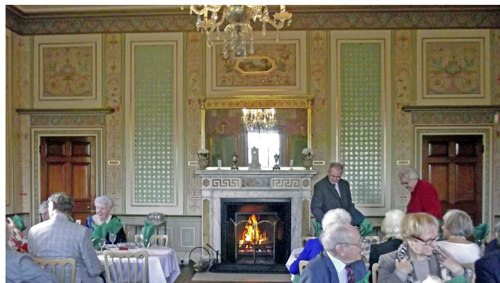
Members in the Gold Room at Lytham at the 2018 Christmas Lunch