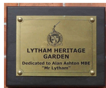
The Plaque in the Heritage Garden