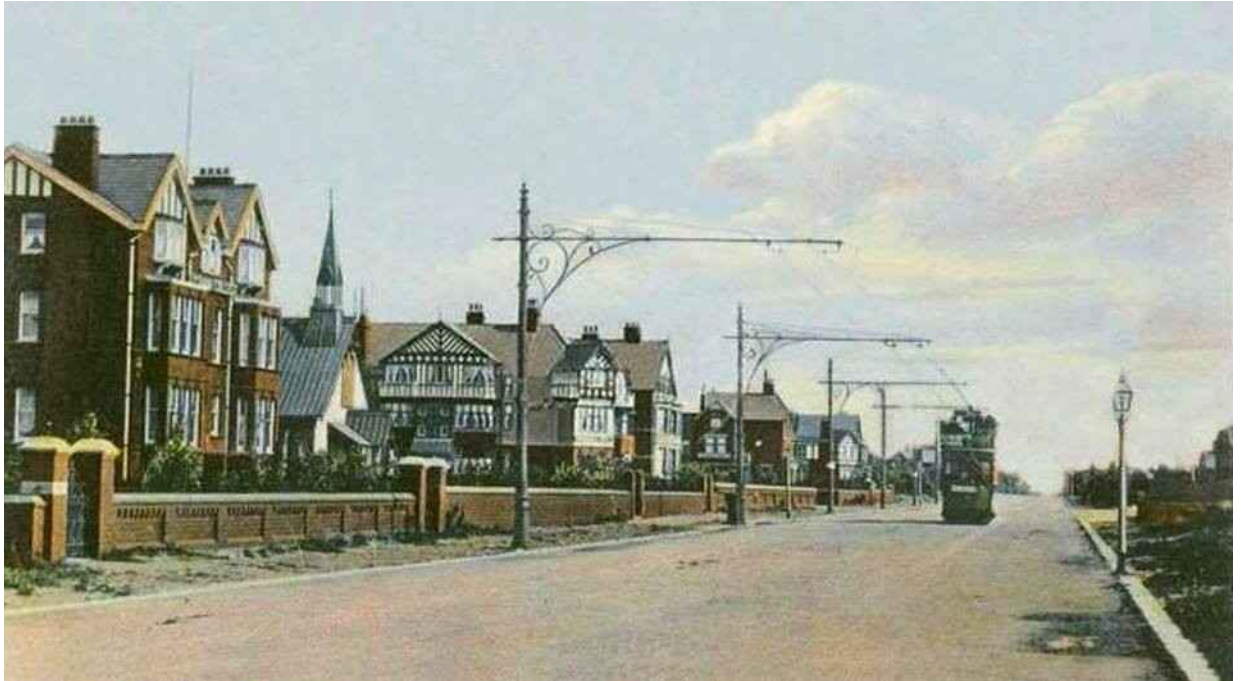
Clifton Drive (c1905 -09) looking east with a tram on the newly electrified system. Lytham College (1901) is the first building on the left (still standing and converted into flats) followed by the "Tin Tab" Fairhaven Methodist Church, (soon to be replaced in 1910 by the current grand building) and the Rossendale Hotel (now a Nursing Home).

No sign yet on the right of the White Church which was completed in 1912.