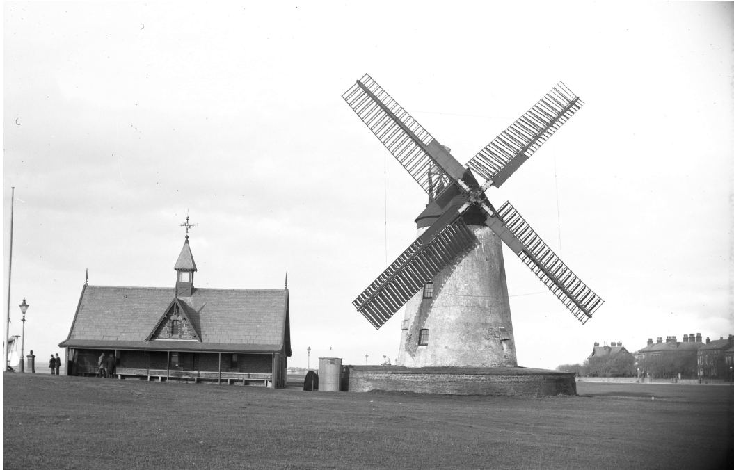
The Mill and Lifeboat House of 1863. The Mill has dispensed with sail cloth and now has the long 'modern' patent sails. These have wooden slats the angle of which could be adjusted by levers. (Think of a Venetian blind in a house or office.)