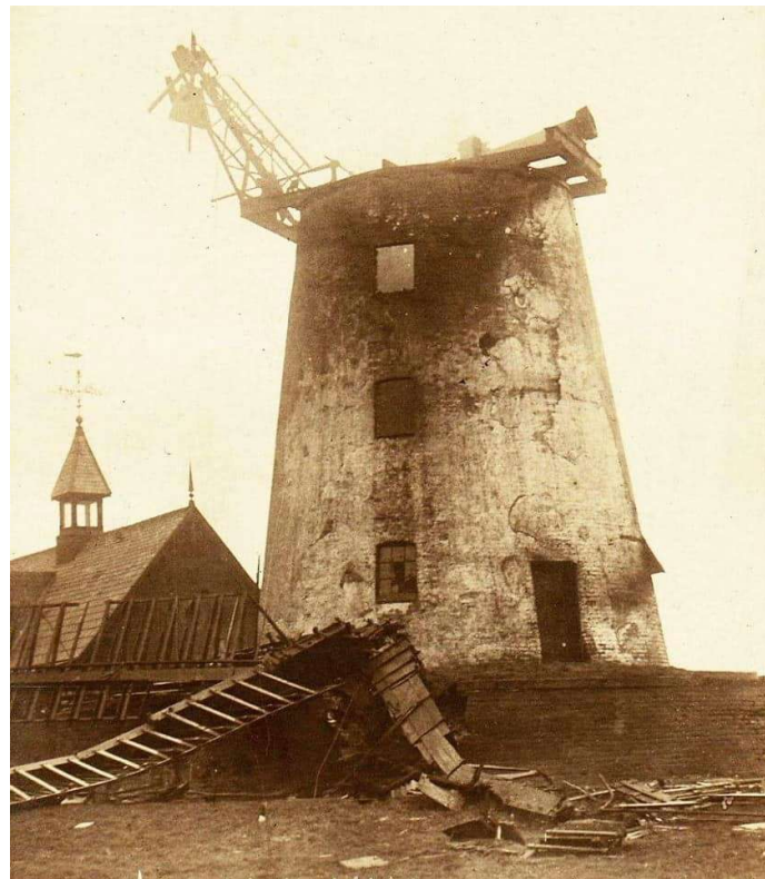
The Mill after the disastrous fire of 1st January 1919 which finished its life as a working mill.